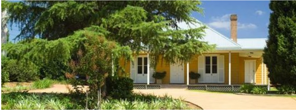
'The Hermitage Cottage' constructed in 1802

Create a service as unique as your loved one's life, because the end of their story matters.